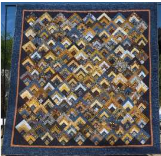
2018 Opportunity Quilt "50 Shades"