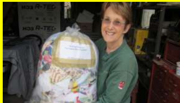
Each bag is labeled "Textile Scraps for Textile Recycling Bales"